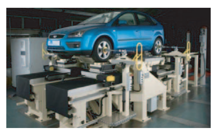
Fig 1: Suspension Parameter Measurement Machine

The SPMM is available in two-wheel or, for higher throughput, four-wheel station configuration. In addition, quiet electromechanical actuators eliminate the need for high pressure hydraulics providing a cleaner and more pleasant customer working environment.