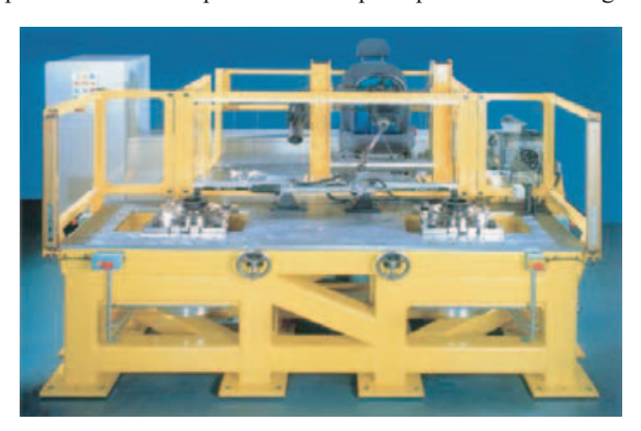
Fig 2: Steering System Test Machine

This is a very high precision computer-controlled machine for the rapid development of vehicle steering systems. Direct drive electrical motors allow for superior actuator control and provide exceptional levels of feedback to the designer in terms of steering feel and accuracy. The machine can also be interfaced with the Group's driving robots to provide controlled position or torque inputs to the steering column.