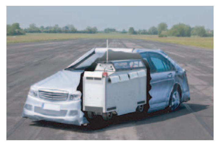
Fig 5: Soft Crash Test Vehicle