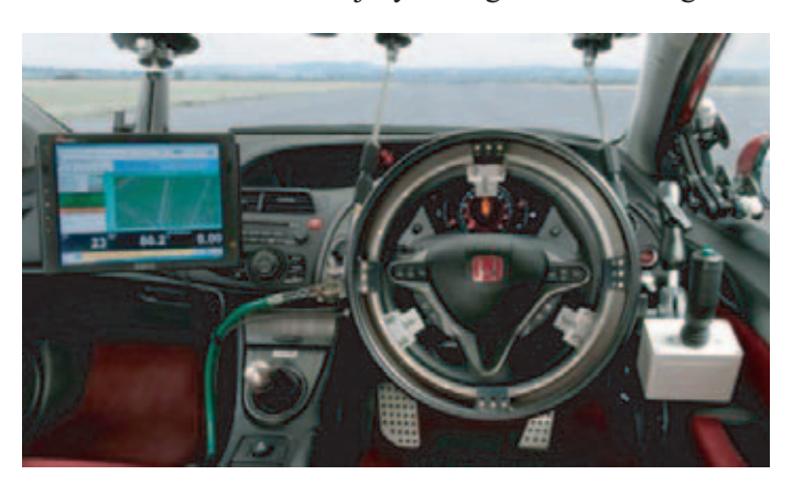
Fig 4: Driverless Test System

By combining the Group's robot range with a proprietary GPS-aided inertial navigation system, the user can guide the driverless vehicle along a pre-defined path with the vehicle's position, speed and time all very precisely controlled. User-friendly software allows for rapid system set up and full remote test control and monitoring. This eliminates the risk of driver injury during vehicle testing.