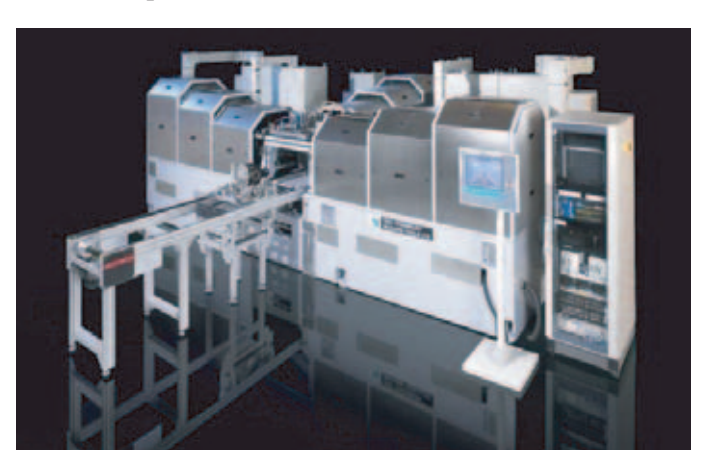
Fig 6: End-of-line defect diagnostic testing equipment incorporating the Group's PLATO NVH test system

The Group's "PLATO" system measures and analyses noise and vibration ("NVH"), primarily from rotating machinery, such as automotive powertrains (gearboxes, axles, power take-off units, 4x4 transfer cases and engines) and power steering systems. Application areas include fast cycle-time, end-of-line quality assurance and defect diagnostic testing in manufacturing plants to add objectivity to driver/passenger assessments of powertrain noise.