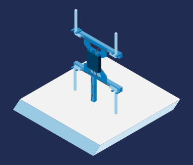
Radio Base Station Secure high throughput data transfer