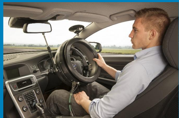
SR60 Torus-S steering robot

A range of motors are available to suit all types of test applications. AB Dynamics robots can be used with an external data capture system and also include built-in multi-channel data capture to minimise the total hardware required in the vehicle. AB Dynamics steering robots can work in conjunction with AB Dynamics pedal, gear changing and clutch robots.