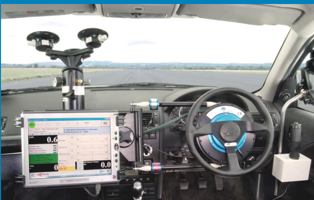
SR60 steering robot

AB Dynamics steering robots apply accurate, controlled inputs to a vehicle’s steering system as required for a wide range of tests including for transient handling behaviour, ADAS testing, legislative tests (fishhook, sine-dwell etc), steering system evaluation, durability and misuse testing. They enable a wide range of steering inputs to be applied with high precision and repeatability, to enable high quality data to be gathered quickly. All AB Dynamics steering robots can be used to form part of a path-following or even driverless system.